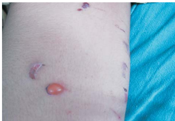
FIG. 1 Tense, hemorrhagic bullae, bizarre shaped, crescent shaped and linear superficial erosions over the thigh.