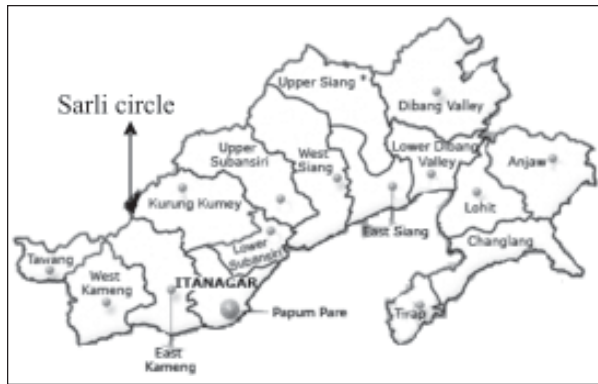
FIG. 1 Location of Sarli circle, Arunachal Pradesh, India.

of symptoms and clinically examined all children. From children meeting the case definition, we collected information about age, sex, place of residence, date of occurrence of paroxysmal cough and immunization status. We also interviewed parents of 18 children who died due to suspected pertussis and who attended the medical camp with their other children, to authenticate the information about actual deaths.