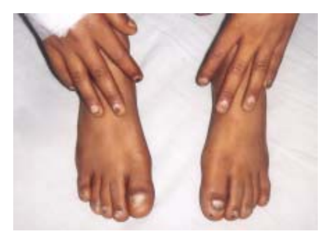
Fig. 1 Dysplasia of nails.

Dyskeratosis congenita (DC) (also known as Zinssor – cole – Engmak syndrome) is an inherited bone marrow failure syndrome which presents with bone marrow failure and diagnostic triad of lacey reticulated pigmentation, dysplastic nails and oral The diagnosis is often made in leukoplakia. adulthood and most of the physical findings appear with increasing age. Treatment is initiated when Hb is <8g/dL, platelets <30,000/µl and absolute neutrophil count <500/µL. Androgen therapy may improve but not cure aplastic anemia. Stem cell transplantation is recommended if there is an HLAmatched sibling donor. There is an increased incidence of carcinomas particularly of the head and neck.