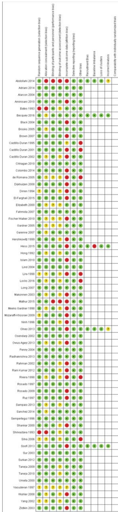
WEB FIG. 2 Risk of bias summary: review authors' judgements about each risk of bias item for each included study.