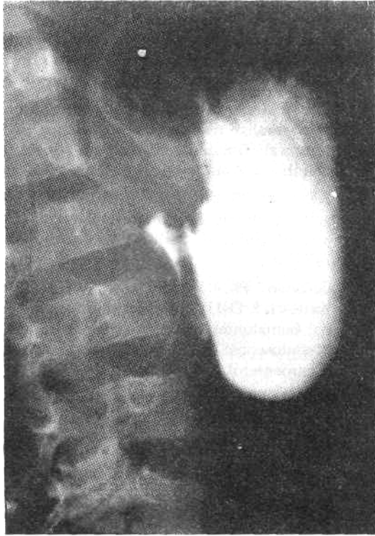
Fig. 1. Gastrograffin meal on day 6 showing a slit-like narrowing of the proximal duodenal lumen by a mass projecting from the free wall.