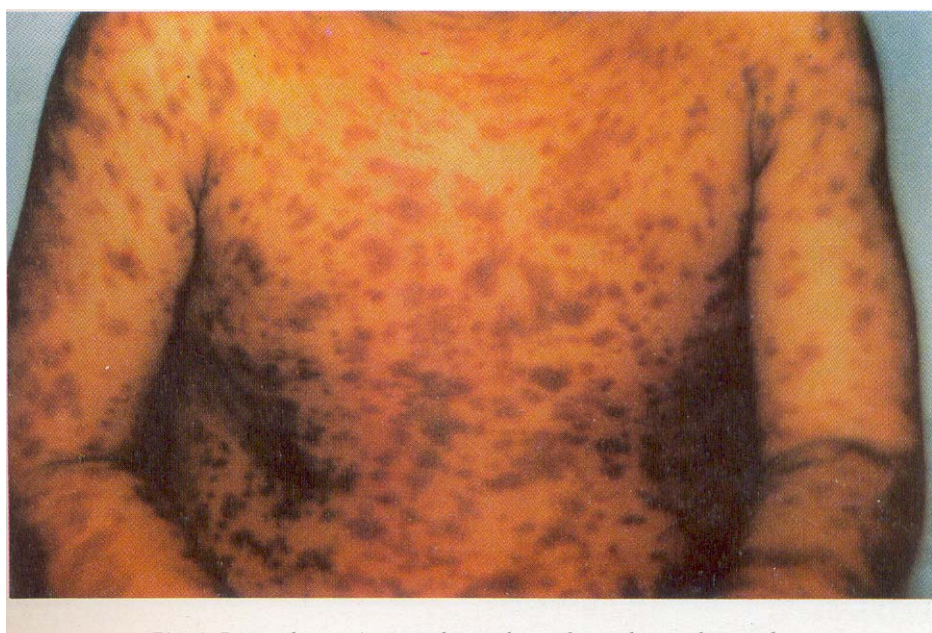
Fig. 1. Brown hyperpigmented macules and papules on the trunk.

The parents were reassured and explained that the child is likely to become asymptomatic by 5-6 years of age and the lesions likely to spontaneously clear during adolescence. Histamine releasing drugs like aspirin, opiates (specially in cough syrups containing codeine) alochol and some pre-anesthetic medications should be avoided. Vigorous rubbing of skin during oil massage and after bath is prohibited. Hydroxyzine hydrochloride, 2 mg/kg in 4 divided doses, was prescribed in our