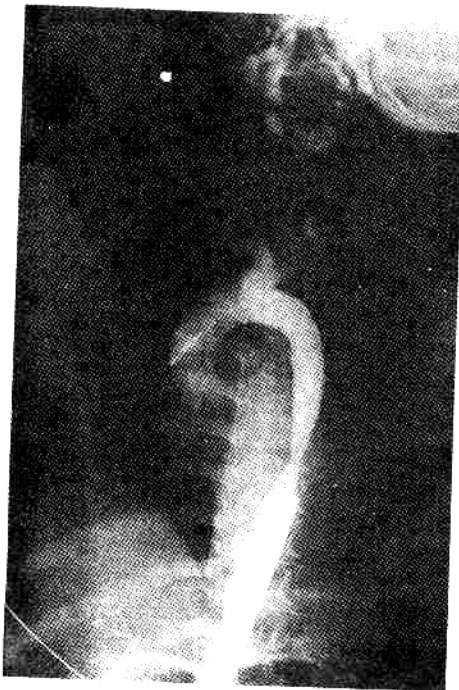
Fig.1. Aortogram showing narrowing of the descending aorta at D6-7 level with absent filling of subclavian arteries

In Indian studies of idiopathic obstructive aortoarteritis(6,7), no association with positive titers of antibody to ds DNA was reported. However, there are isolated case reports of the occurrence of aortoarteritis with autoimmune disease(8,9). Ascending aortitis has been reported in some patients with SLE(4,10,11). To our knowledge, no association of descending aortitis with SLE is previously reported. The possibility that the association of SLE and aortitis was incidental cannot be, however, ruled out.