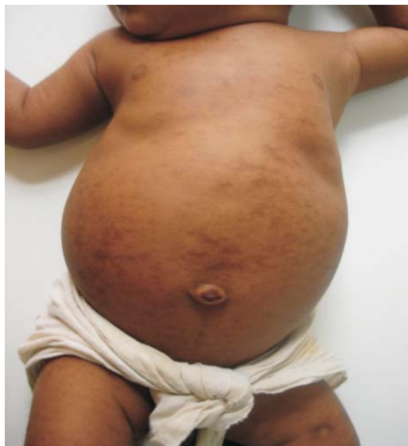
FIG. 1 Brownish pigmentation seen over the abdomen.

No treatment is required for bronze baby syndrome as the pigmentation slowly disappears after stopping phototherapy.