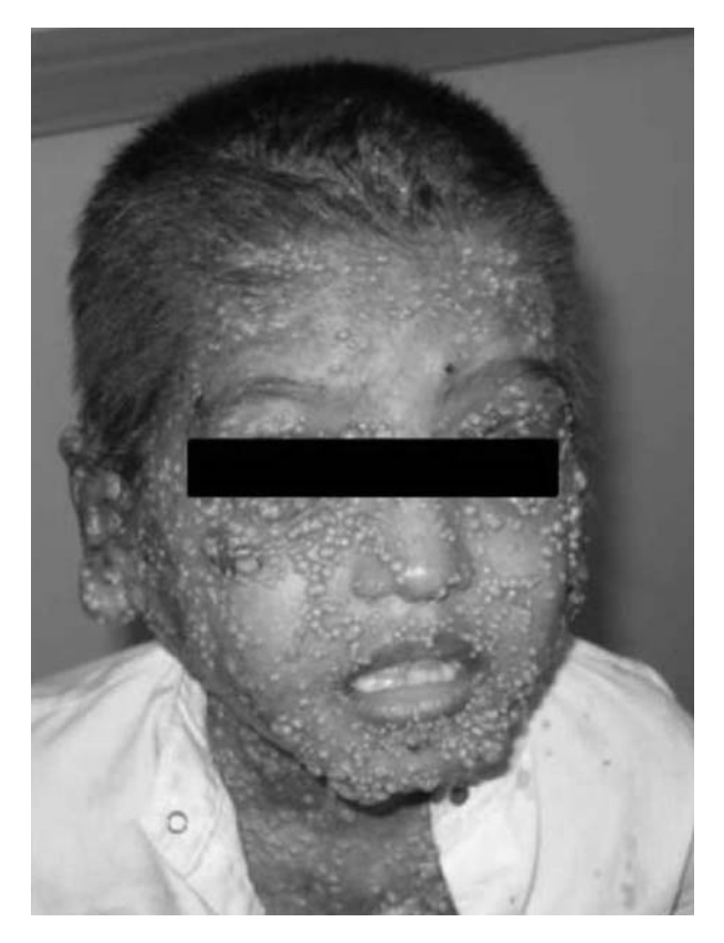
FIG. 1 Patient with HIES due to DOCK8 deficiency with disseminated Molluscum contagiosum.

This category of PID includes 5 groups of diseases [1] of which leukocyte adhesion deficiency-I (LAD-I), chronic granulomatous disease (CGD) and severe congenital neutropenia (SCN) are some of the common diseases. Patients with phagocytic defects usually present in neonatal period. Delayed separation of umbilical cord beyond 2 weeks along with omphalitis is suggestive of a