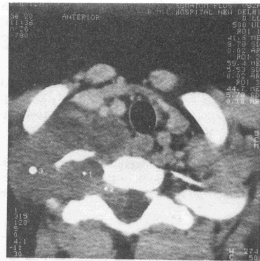
Fig. 1. The CT Scan of neck and upper thorax showing a mass encroaching through the thoracic inlet and shifting trachea to the left. The same mass is extending into the intraspinal area.

Fine needle aspiration cytology and histopathology of the mass in the neck revealed tissue composed of densely packed small cells with round nuclei, scanty to