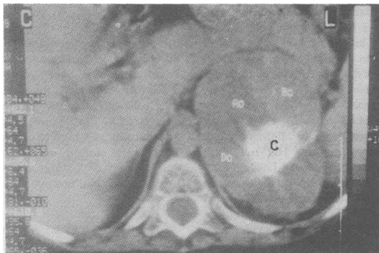
Fig. 2. Abdominal CT scan showing left adrenal tumor with calcification(C), suggestive of malignancy (Case 2).