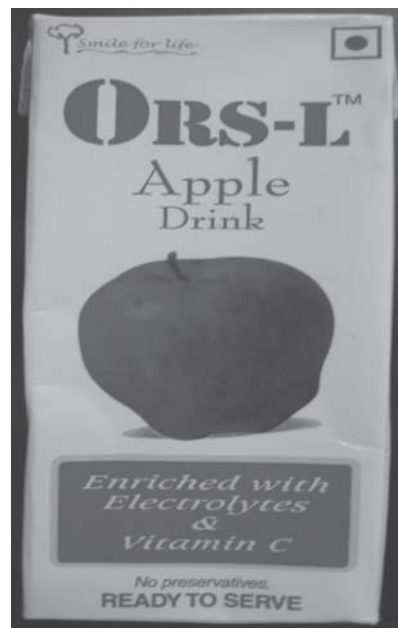
FIG. 1 Apple drink mislabelled as 'ORS-L'.

It is unfortunate that in our country apple juice can be openly mislabelled and sold as ORS. All pediatricians