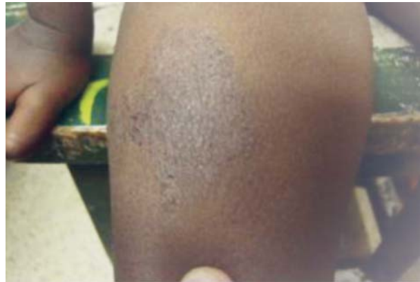
FIG.1 A discoid patch formed due to coalescence of the follicular lesions with excoriation marks on the periphery.

This condition is appropriately called follicular eczema as the biopsy shows spongiosis while the morphology shows follicular lesions. Other common differentials include keratosis pilaris (diffuse, follicular keratotic lesions with perifollicular erythema), lichen spinulosus (grouped, spiny, keratotic, papules) and