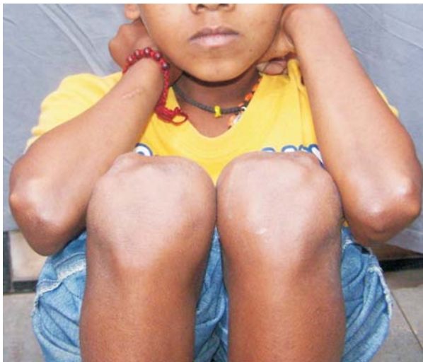
FIG. 1 Nodular lesions on the extensor aspect of bilateral elbow and knee joints.

A nine-year-old boy presented with multiple painful nodular lesions on the extensor aspect of bilateral elbow and knee joints since 15 days ( Fig. 1 ). There was no sore throat, pyoderma, arthralgia, abdominal pain, drug intake or Koch's contact. On enquiry, fever and exertional dyspnea were present since 5 days. Grade III/VI pansystolic murmur was present in the mitral area. Chest x-ray and ultrasonography of abdomen were normal.