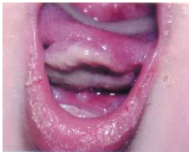
FIG. 1. Ulcerative traumatic granuloma on the anterior ventral part of the tongue; note sloughing necrotic pseudomembrane, and dry lips.

An 8 month-old infant boy with cerebral palsy presented with a large exophytic lesion under the tongue with erythema surrounding a removable, fibrinopurulent membrane and granulation tissue proliferation present for several weeks ( Fig. 1 ). He was unable to suckle for feeding. Laboratory tests were normal. Biopsy was suggestive of distinctive ulcerative traumatic granuloma with stromal eosinophilia (Riga-Fede disease). Contact of the tongue with the sharp, newly erupted mandibular teeth was apparent. Grinding the teeth edges and covering with resin resulted in rapid resolution within 5-10 days.