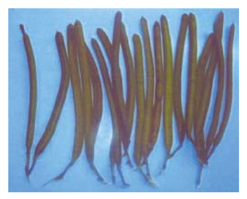
Fig. 2. Pods (fruits) of Cassia occidentalis plant.

anthraquinone glycosides. Ann Pharmacother 2005; 39: 1353-1357.