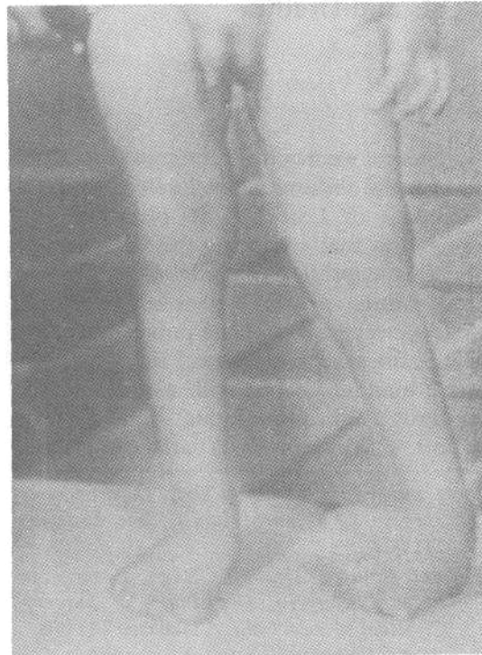
Fig. 2. Case 2 showing CTEV with 8 toes polydactyly and agenesia of patella.