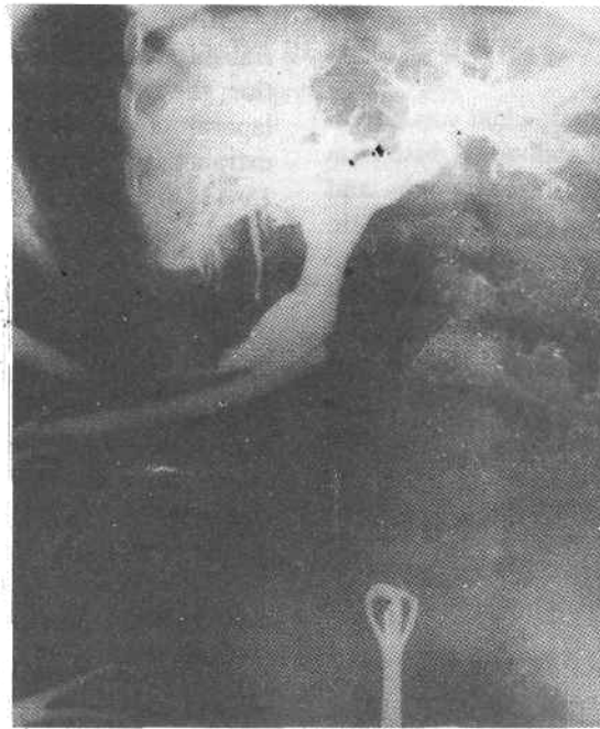
Fig. 2. Intra-operative cholangiogram showing dilated intra-hepatic biliary radicals and common hepatic bile duct. Note that no dye was going down beyond the communication of the diverticulum with the extrahepatic bile duct system.