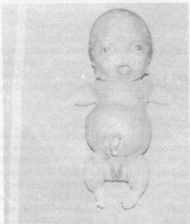
Fig 1. Photograph of Achondrogenesis Type II (Langer-Saldino) showing extremely short limbs and globular body.