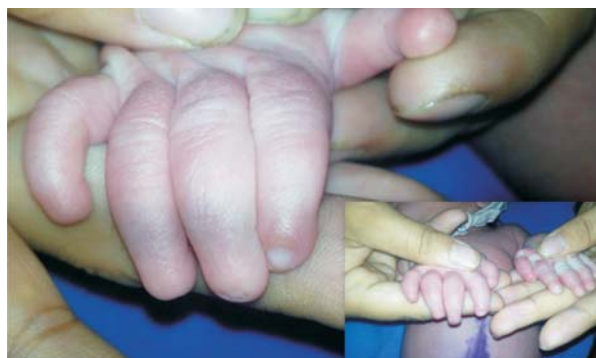
FIG. 1 Absence of the finger nails in congenital anonychia.

Anonychia refers to absence of nail plate with an autosomal dominant or recessive inheritance. Congenital anonychia is rare and may be associated with other ectodermal or mesodermal malformations like epidermolysis bullosa, DOOR syndrome (deafness, onychodystrophy, osteodystrophy, and mental retardation)