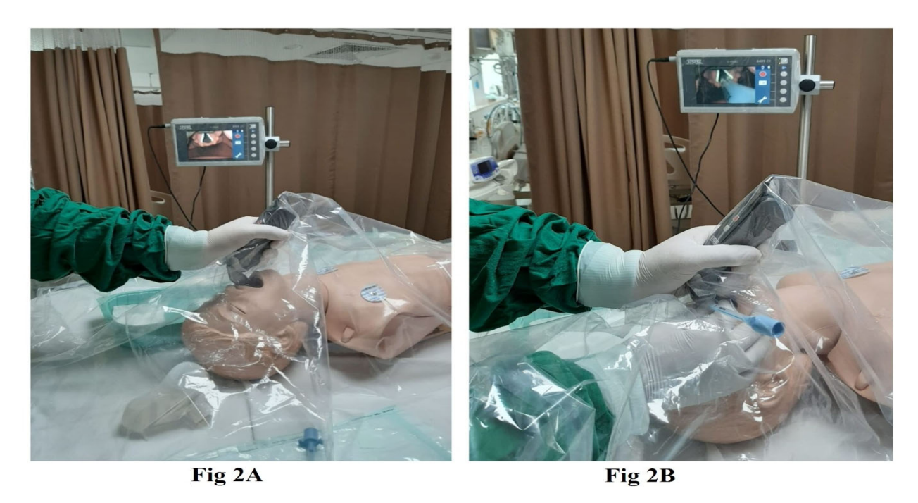
Fig. 2 (a) Video-laryngoscope assisted intubation; (b) shows a sheet covering the face and chest during intubation.