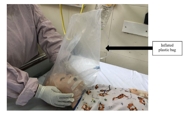
Fig. 4 Covering the face with a plastic bag or a sheet, to prevent aerosol spread during extubation.