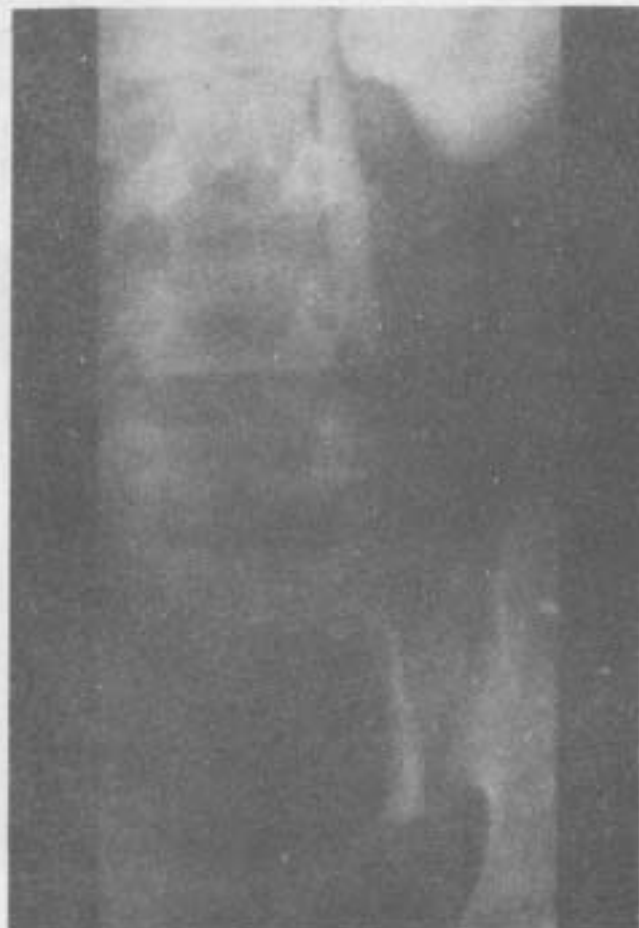
Fig. 3. USPCAP (6 hour film) showing obstruction at left ureterovesical junction.

Case 4: A ten-month-old boy presented with a history of failure to thrive and recurrent urinary tract infection. His serum creatinine was 4.0 mg/dl and the IVP