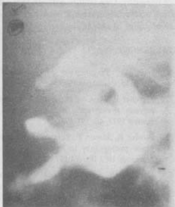
Fig. 6. USPCAP showing abnormally rotated solitary right kidney with hydronephrosis.

exact nature of the anatomical abnormality. The study revealed medial rotation abnormality of the kidney with obstruction at the ureterovesical junction. He underwent a high ureterostomy and is awaiting definitive surgery.