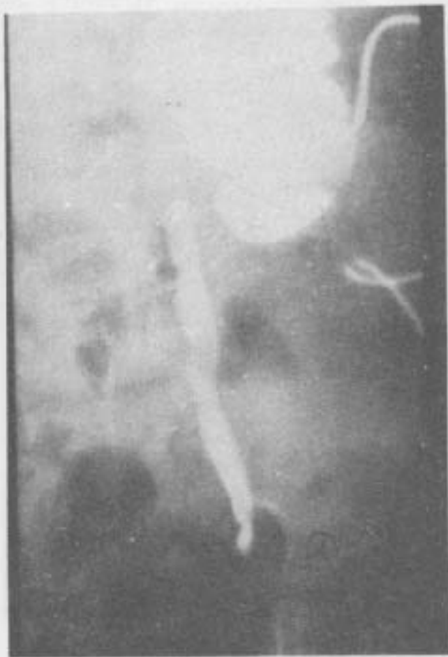
Fig. 2. USPCAP showing obstruction at both pelviureteric and ureterovesical junction.

Case 2: A two-year-old boy had undergone a left sided pyeloplasty and ureteric reimplantation, both done at the same time for obstruction at pelviureteric and vesicoureteric junctions. He was referred because of nonvisualization of left kidney on IVP six months later. Isotopic renogram also showed negligible function in the left kidney. MCU was normal. USPCAP (Fig. 2) revealed mild obstruction at the ureteropelvic junction and severe obstruction at the ureterovesical junction. After a short interval of drainage by a percutaneous catheter the pyeloplasty was revised and the lower end of ureter brought out as end ureterostomy. Neoureterostomy was deferred for six months. Subsequent functional recovery was satisfactory.