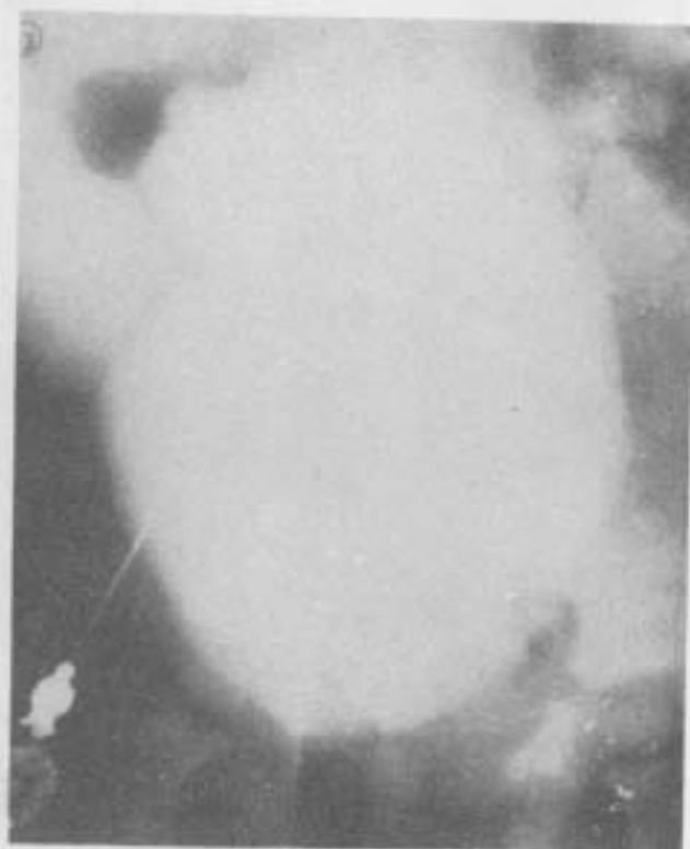
Fig. 5. USPCAP showing massive right hydroureteronephrosis and megacystis.