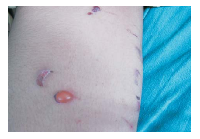
FIG. 1 Tense, hemorrhagic bullae, bizarre shaped, crescent shaped and linear superficial erosions over the thigh.

impulse control and admitted to inducing lesions with chemicals and pinching. She was kept under observation and treated with Olanzapine and topical antibiotics with counseling which led to healing of lesions.