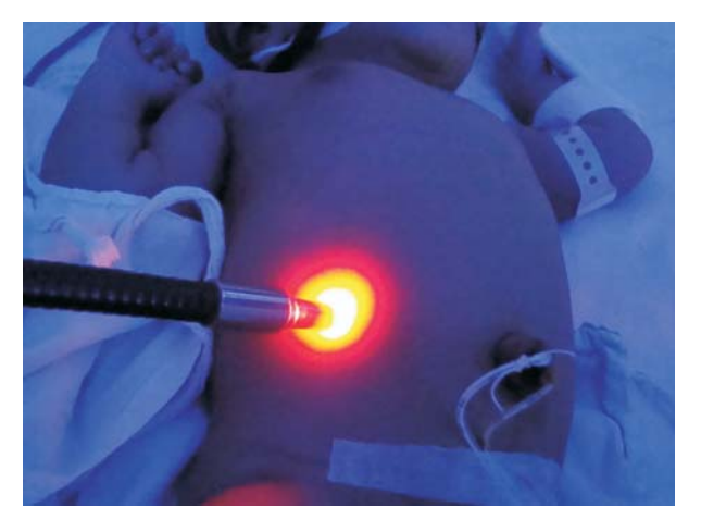
Fig.2 Transillumination of a normal abdomen.