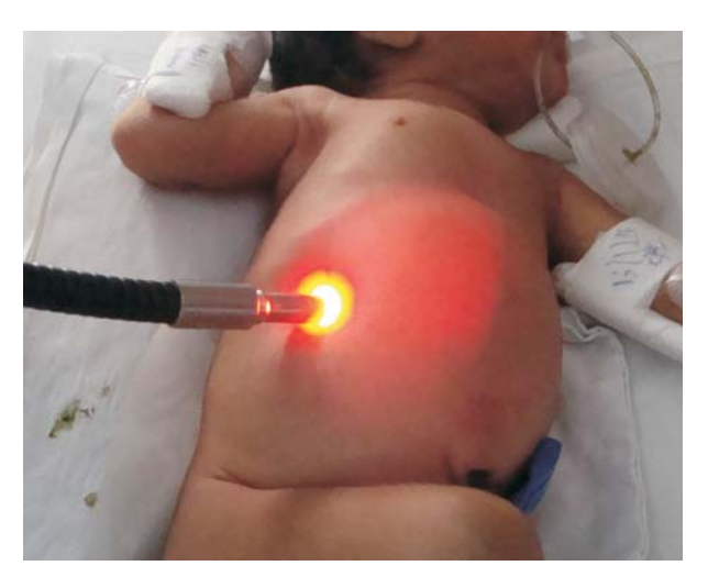
FIG.1 Transillumination of the abdomen showing pneumoperitoneum.

Department of Neonatology, Christian Medical College, Vellore 632004, India. niranjan@cmcvellore.ac.in