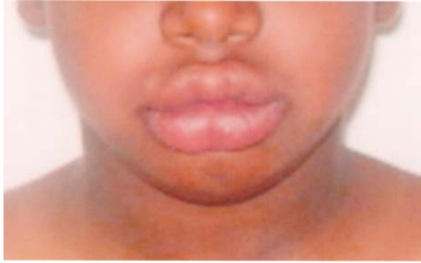
FIG. 1 Swollen lips due to granulomatous cheilitis.

granulomatous changes are confined to lip. Melkerson-Rosenthal syndrome is the term used