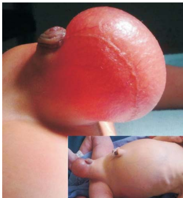
FIG.1 Brilliantly transilluminant scrotum suggestive of pneumosrotum.

Pneumosrotum secondary to recto-sigmoid perforation following rectal instrumentation is extremely rare. Management must be directed towards its cause. Rectal irrigation must be performed gently with small volume (5-10 mL) of normal saline, using soft red rubber catheter to prevent such complications.