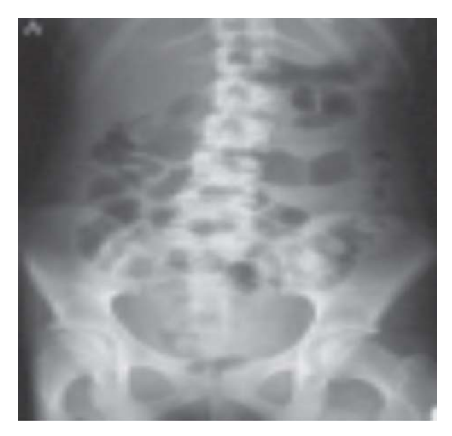
FIG. 1. Pre treatment plain abdominal films. Note dilated upper small bowel loops typical of abdominal cocoon.

serosangunous fluid was seen with normal postoperative cecum and collapsed terminal ileal loops in lower abdomen and pelvis, with no evidence of adhesions. Further exploration revealed herniation of upper small bowel loops into a hernial sac in the transverse mesocolon through a defect medial to the inferior mesenteric vein, in the form of partial abdominal encapsulation forming abdominal cocoon (Fig. 2). A left paramesocolic hernia with intestinal obstruction was diagnosed. All obstructed small bowel loops were reduced from the hernial sac into the peritoneal cavity through an extremely open treitz orifice. The bowel was viable and there were no adhesions. Sac was completely everted and excised preserving inferior mesenteric vein. The Treitz arch forming the defect was closed using perivenous adventitia and the inferior mesenteric vessels were attached to the posterior peritoneum.