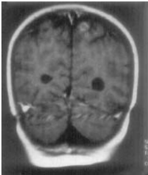
Fig.1. Axial MRI Scan of the brain demonstrating the presence of a ring enhancement abscess in the right parietal lobe.

Cerebral aspergillosis occurs in about 10 to 20% of all cases of invasive aspergillosis, and has a very poor prognosis.