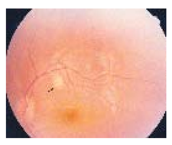
Fig. 1. Showing a choroid tubercle in posterior pole of left fundus.

Department of Pediatrics, Government Medical College, Rajindra Hospital, Patiala 147 001, India.