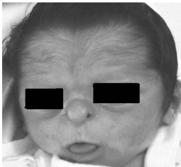
FIG. 1 Patient at age of 12 days: Characteristic facies with beaked nose, hypoplastic alae nasi, long philtrum with thin upper lip and frontal hirsutism with upsweep of hair.

On examination, on day 12, she weighed 2.3 kg, had head circumference of 32 cm and length of 50 cm. She had a striking facies ( Fig. 1 ) with a small beak-like nose with hypoplastic alae nasi, long narrow upper lip, open mouth with protruding tongue, prominent eyes with palpebral fissures slanting upwards and epicanthic folds. She had a