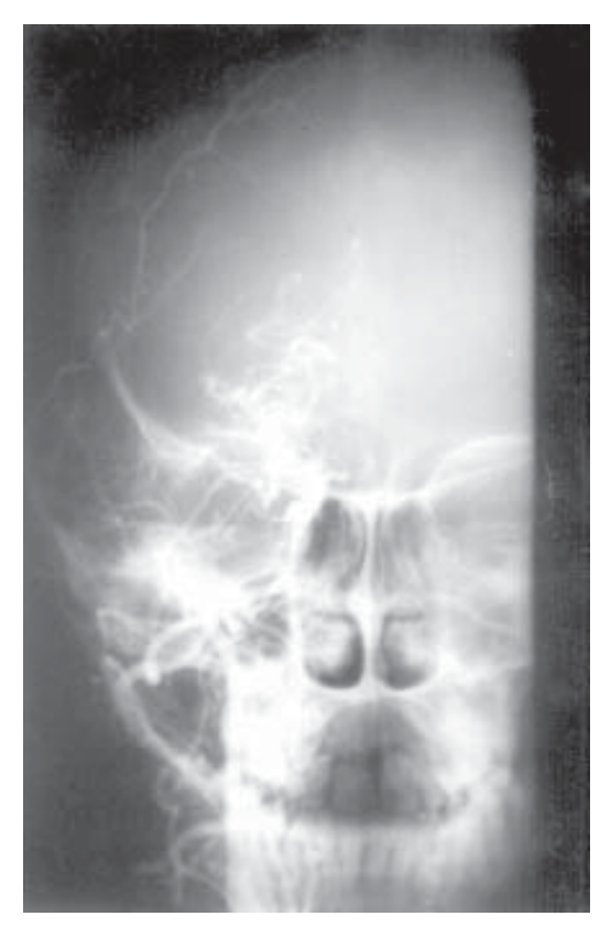
Fig. 2. Moyamoya collaterals on carotid angiogram.

Moyamoya disease is characterized by stenosis or occlusion of the terminal portions of the intracranial internal carotid arteries and the proximal portions of the anterior and the middle cerebral arteries associated with abnormal vascular networks in their vicinity visible as 'puff of smoke' on angiography.