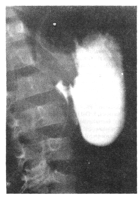
Fig. 1. Gastrograffin meal on day 6 showing a slit-like narrowing of the proximal duodenal lumen by a mass projecting from the free wall.

or purpuras(7,10). A bleeding diathesis should be excluded even in the absence of any suggestive past or family history.