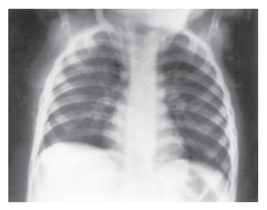
Fig. 2. Chest X-ray 3 weeks after discharge.

respirations at a rate of 38 per minute with no chest recession or hyperinflation and vesicular breath sounds were audible equally. On follow-up at two and six weeks after discharge, he was asymptomatic with no recurrence of respiratory distress. The chest radiograph at discharge and at follow-up ( Fig. 2) showed normal lung markings. His serum calcium was 9.4 mg/dL, serum phosphorus was 5.8 mg/dl and serum alkaline phosphatase was 313 U/L at follow up. Ultrasound abdomen showed no evidence of nephrocalcinosis or urinary tract lithiasis and urinary spot calcium/creatinine ratio was 0.173.