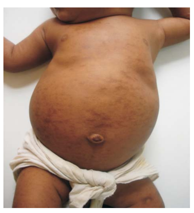
FIG. 1 Brownish pigmentation seen over the abdomen.

No treatment is required for bronze baby syndrome as the pigmentation slowly disappears after stopping phototherapy.