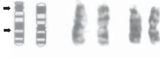
Fig. 2b. Mother's partial karyotypes showing inversion of chromosome 13. Abnormal chromosome is on right side of the pair. Arrows point to the breakpoints.

The region q 22 @ q ter which is trisomic in this case is common to the trisomic cases reported by Chu et al (2). Trigonocephaly and polydactyly appear to be commonly seen features associated with trisomy of distal part of 13q(2,5,6). The syndrome of partial trisomy of 13q seems to have a characteristic phenotype. The features are trigonocephaly, polydactyly, renal anomalies, central nervous system anomalies and ear malformations, sharing similarity with 'C' syndrome. Trigonocephaly has also been reported with trisomy of part of 13q proximal to q21.1(7). Trigonocephaly which is the conspicuous feature of this case is also a feature of many other syndromes like Say-Meyer syndrome, Baller-Gerold syndrome, many chromosomal syndromes namely del (3q), del (7p), del (9p), del (11q). It is also found in association with various malformations of heart, brain, limbs, genitourinary tract but not conforming to any delineated syndrome. A large study of 237 cases of trigonocephaly revealed that in 184 cases, trigonocephaly was an isolated abnormality and these cases had normal mental function(7). In the study by Azimi, et al. also, 72% of trigonocephaly cases were non-syndromic and 5.6% of the cases were familial(8).