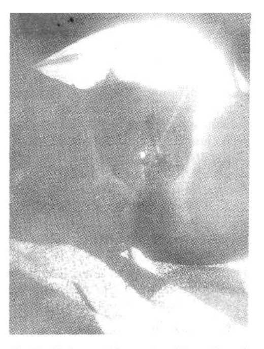
Fig. 2. Male pseudohermaphroditism. Note the short, inconspicuous phallus and bifid empty scrotum.