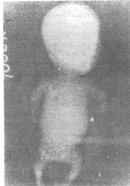
Fig. 2. Achondrogenesis, note the extremely short limb bones with unossified vertebrae.

the list of osteochondrodysplasias has been expanding, these classifications help to narrow the possibilities, in individual cases, to one or two broad categories and are of great help in diagnosis. Of the 169 cases studied, we were able to group 100 cases according to this classification. Many of our cases with obvious skeletal disorder did not find a place under the new classification. A detailed classification of dysostosis and expanding the scope of classification of dysplasias may help to categorize many of the inherited disorders of skeleton for which no proper grouping exists.