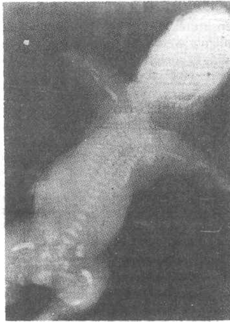
Fig. 1. Thanatophoric dysplasia; note the short, bent and "telephone receiver" femora.