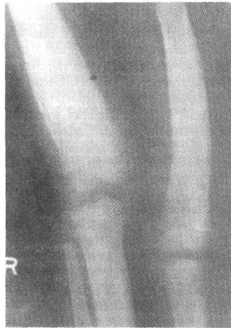
Fig. 4. Englemann's Disease; note diaphyseal thickening of long bones.

feasible due to improved ultrasound resolution, better sonographic skill and experience(9). In our study ultrasound examination was carried out in pregnant women with previously affected children and in mothers who gave family history of short stature or other anomalies. In 7 cases an antenatal diagnosis was possible. Ultrasonography is already finding routes into interior parts of our country. As it is noninvasive, it is more acceptable to mothers. Increased utilization of this modality will help to identify more number of cases antenatally.