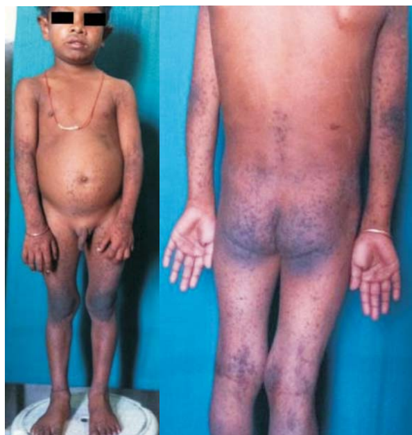
FIG. 1 Multiple hyperkeratotic lesions including (a) knees and elbows, and (b) buttocks.

Conventional therapy for severe disease still relies greatly on oral retinoids. Acitretin is effective at 0.6 mg/kg/day, the hyperkeratosis is reduced and papules are flattened. Basic measures include use of sunscreens, cool cotton clothing, and avoidance of hot environment. Moisturizers with urea or lactic acid can reduce scaling and hyperkeratosis. Surgical treatment includes dermabrasion, carbon dioxide laser, and the erbium YAG laser. The condition runs a chronic relapsing course, with exacerbations throughout life.