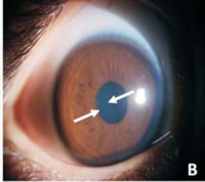
FIG.1 Slit lamp photographs of affected (left) eye; Panel A: on 10th day of life revealing diffuse corneal edema (white arrow); Panel B: On day 28 of life revealing vertical break at the level of descemet's membrane (white, double arrow).

single or multiple descemet membrane breaks appear as vertical or oblique median striae. These corneal lesions are primarily unilateral and may cause amblyopia. Loss of vision may be because of the opacities of the striae themselves or because of induced astigmatism, which results in amblyopia. Although penetrating keratoplasty has been the treatment of choice, but this leads to frequent complications in children.