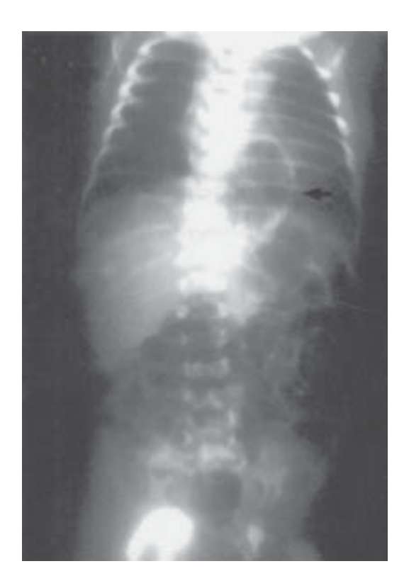
Fig 1. Infantogram (A-P view) of case 1 showing a gas filled cystic lesion (arrow) in the left lower chest.

of esophageal atresia due to excessive salivation, regurgitation of feeds and 2 episodes of cyanotic spells. Physical examination did not reveal any overt signs, but an orogastric tube was arrested at 15 cm from the gum margin. Plain X-ray of the chest with orogastric tube in situ demonstrated the presence of tip of the tube at seventh thoracic vertebral level as well as the presence of an abnormal gas shadow in the right para vertebral region in the lower chest (Fig. 2). A contrast study using water-soluble contrast revealed dilatation of esophagus and an intrathoracic stomach (Fig. 3). The stomach was in a state of volvulus and a small quantity of contrast passed distally into the duodenum.