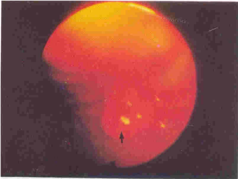
Fig. 3. Duodenal varix (arrow) in a child of portal hypertension presenting with hematemesis.