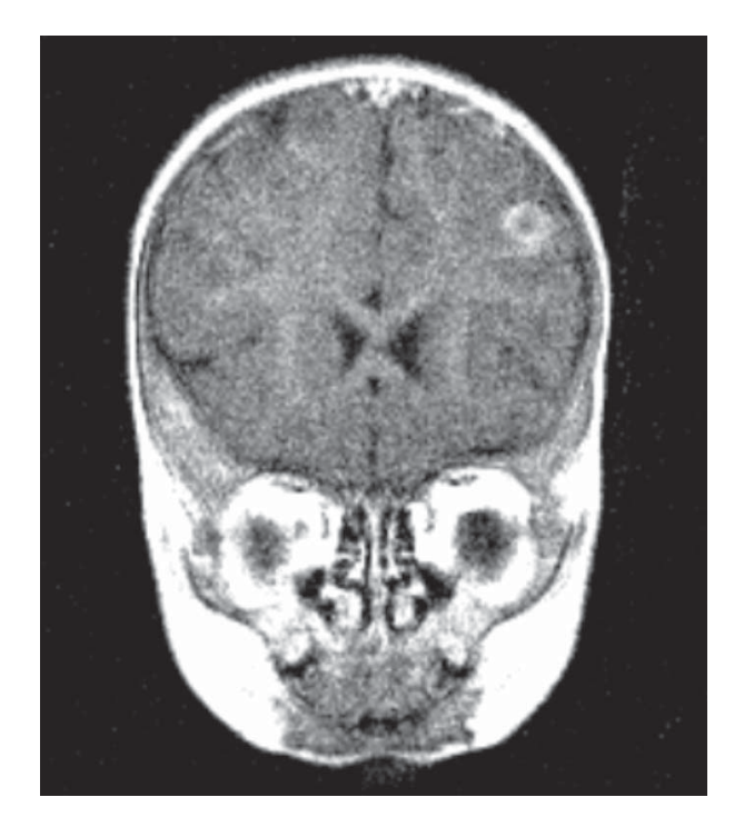
FIG. 2 MRI Brain showing well-defined lesion with a peripheral hypointense rim and cental hyperintensity.

balamuthia (4). These free living amebas can be found in natural bodies of water and usually there is history of bathing in a river or a pond.