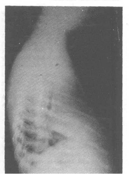
Fig. 2. Lateral X-rays showing thinning of the ribs with disappearance of the sternum.

Our patient presented with increasing deformity of the right chest wall over a period of a few months. Serial X-rays showed gradual thinning and subsequent disappearance of the anterior ends of the upper 6 ribs. The clavicles and sternum also appeared markedly thinned out. There was no history of trauma, or evidence of infection or inflammation thus ruling out secondary causes of osteolysis. The biochemical and metabolic profile of the patient were normal