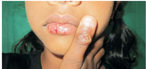
FIG 1. Grouped vesicles/erosions over lower lip and right thumb.

Herpetic whitlow refers to herpes simplex virus infection of digits. In children, it commonly occurs from primary herpetic gingivostomatitis due to auto-inoculation from finger/thumb sucking or nail biting. Fingers (thumb), palms and wrists are involved in decreasing order of frequency. Fever, constitutional symptoms, painful erythematous swelling with vesicles/pustules appears over infected site. Painful regional lymphadenopathy/lymphangitis may be present. Spontaneous resolution may occur in 18-20 days. Differential diagnosis for primary herpetic gingivostomatitis includes streptococcal infections,