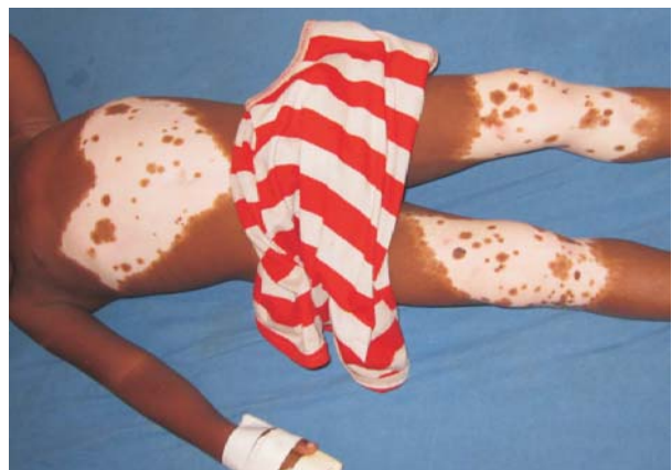
FIG.1 White forelock and depigmented patches over the knees and the heart shaped depigmented patch over the abdomen.

Piebaldism is inherited as an autosomal dominant condition and is also known as partial albinism. The distribution of the depigmented patches seen in our patient