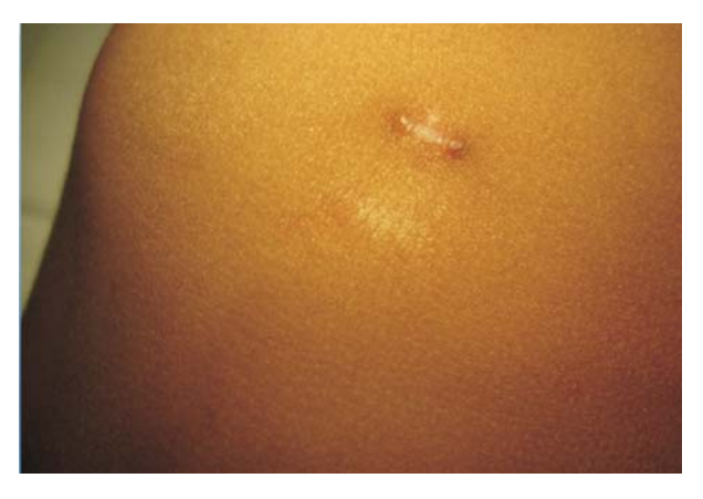
FIG. 1 Porcelain white-colored, plate-like, subcutaneous swellings over the left upper lateral chest wall.